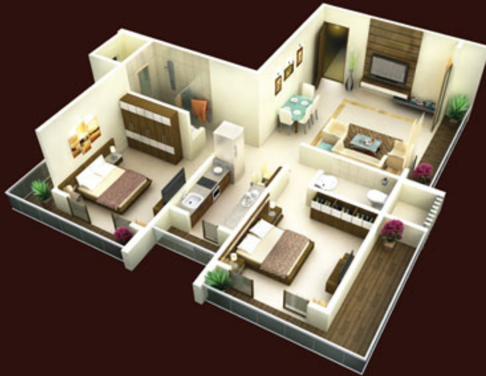
2 Bedroom Hall Kitchen